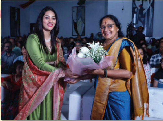
A warm welcome to the Chief Guest