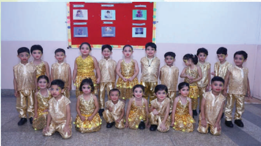
Children sparkling like constellations under a sky of dreams.