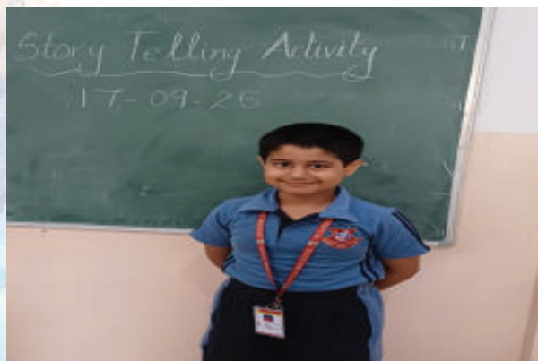
Young storytellers weaving tales with rhythm and melody.