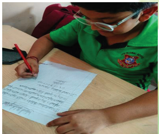
Quick thinkers at work – creating lively word chains.

They eagerly browsed through the collection, The classroom buzzed with excitement as students participated actively, collaborated with peers, and displayed a healthy competitive spirit. The activity successfully combined learning with fun, ensuring that the goal of strengthening vocabulary and promoting creative expression was effectively achieved.