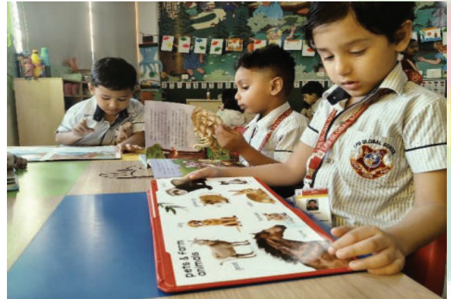
Little readers immersed in colourful picture books and stories

The DEAR initiative beautifully underscored the importance of nurturing reading habits early in life, cultivating not only language skills but also imagination, empathy, and a lifelong love for learning. By celebrating reading as a joyful, community experience, the program reminded everyone that sometimes, the best way to move forward is to pause, open a book, and let the story lead the way.