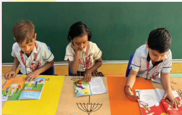
The gentle rustle of pages filling the classroom with curiosity.