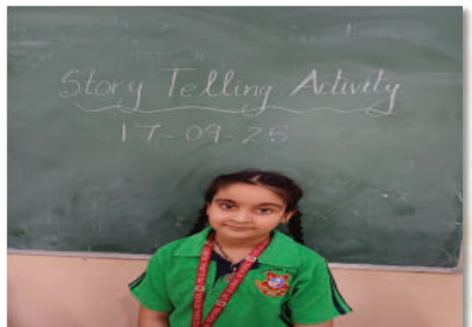
Tiny voices carrying big lessons of kindness and honesty.

The Musical Storytelling Activity proved to be an enriching blend of fun and learning, where imagination and expression came together to create a truly memorable experience for both the participants and the audience.