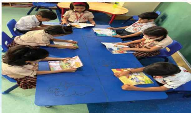
The classroom transformed into a world where reading takes the lead.

From colourful picture books sparking curiosity in the youngest learners to captivating stories engaging the older ones, each child discovered that books are more than words—they are companions, adventures, and teachers in themselves.