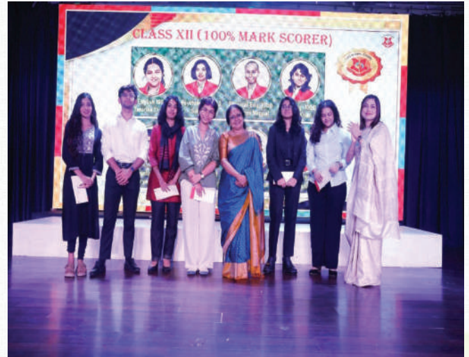
Shining examples of dedication – our toppers receiving well-deserved recognition.