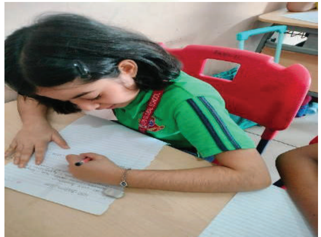
Concentration and creativity flowing as children form new words.

This not only improved spelling and focus but also sharpened their quick-thinking ability while keeping the challenge lively and enjoyable. The second task, Word-Building Exercise, involved forming as many meaningful words as possible from a given root word within a set time limit. This enhanced students' word formation skills, expanded their vocabulary, and fostered originality in their thought process.