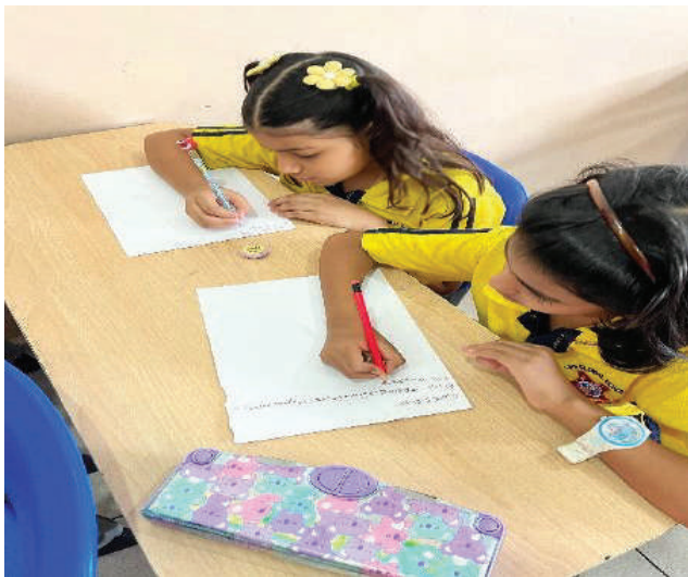
Building words, building confidence, building creativity.

The session included two engaging tasks. The first, Word Chain, required students to create a sequence of words where each new word began with the last letter of the previous one.