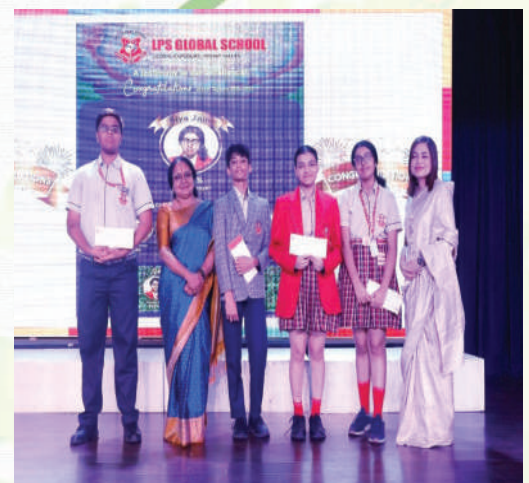
Felicitation of achievers – inspiring juniors with their success stories.