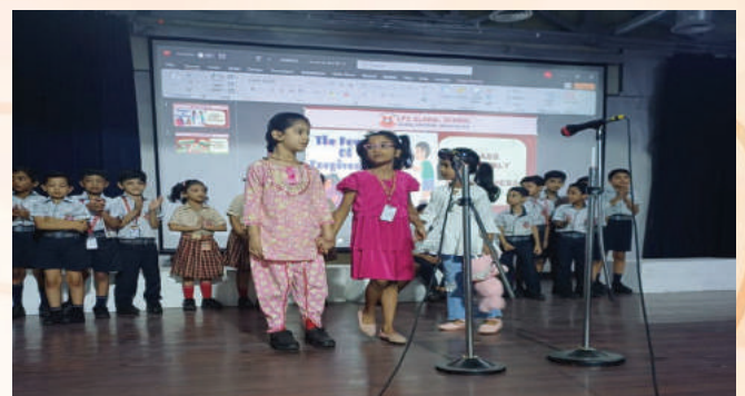
Little learners spreading the message of forgiveness in everyday life.

The assembly concluded with the uplifting message: “Forgiveness is the path to true peace and strength.” Students were inspired to practice forgiveness in classrooms, playgrounds, and at home, spreading kindness and nurturing compassion in everyday life.