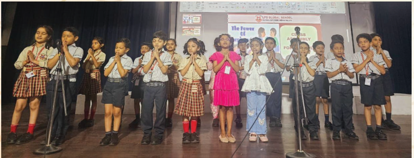
A prayer for peace, compassion, and courage

Class II Brahma Putra conducted a thoughtful assembly on the theme “Forgiveness”, beginning with a prayer seeking peace, compassion, and the courage to let go of anger. This set a calm and reflective tone for the morning.