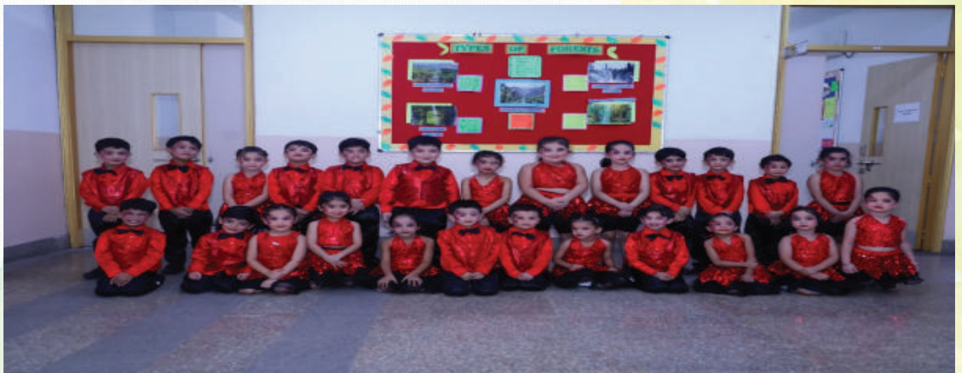
Graceful dancers embodying the spirit of innocence and creativity.