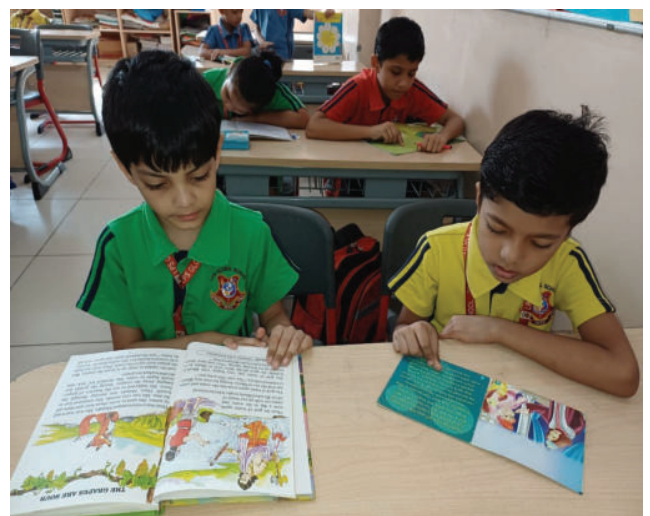
Quiet moments of reflection and learning during DEAR Time.

The DEAR initiative beautifully underscored the importance of nurturing reading habits early in life, cultivating not only language skills but also imagination, empathy, and a lifelong love for learning. By celebrating reading as a joyful, community experience, the program reminded everyone that sometimes, the best way to move forward is to pause, open a book, and let the story lead the way.