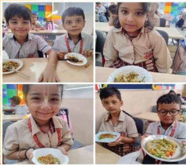
Creative bowls of Sprouts Chaat, decorated with love and excitement.

Dressed in adorable aprons and chef caps, the young chefs brought along sprouts, onions, tomatoes, cucumbers, lemons, Monaco biscuits and spices, and skillfully combined them to prepare their healthy treats. With great excitement, they