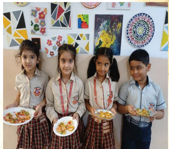
Children proudly presenting their culinary masterpieces.

After the preparation, students relished the joy of tasting their own dishes and also shared them with their classmates, spreading the spirit of togetherness. The activity was a wonderful blend of learning and enjoyment, as it encouraged children to value healthy eating habits, enhanced their creativity, and nurtured essential life skills in a playful, hands-on manner.