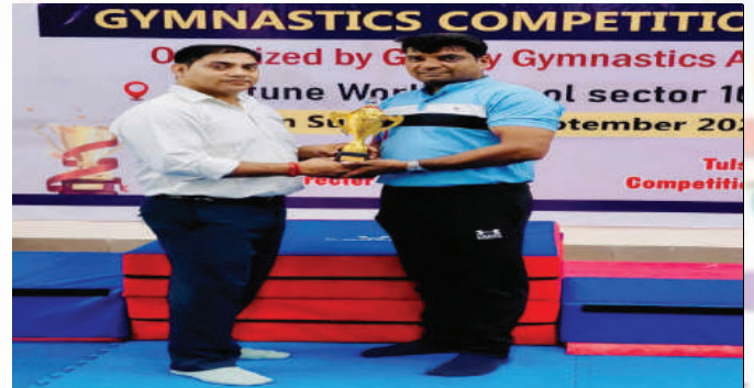
Coach proudly accepting the victory trophy!