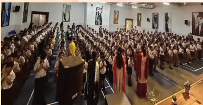
A moment of calm and reflection with folded hands.

The highlight was a skit where friends faced a misunderstanding that caused hurt feelings. The students showed how holding onto anger created distance and sadness, and how one act of forgiveness restored joy and harmony. The performance beautifully conveyed that forgiveness heals relationships and brings inner peace.